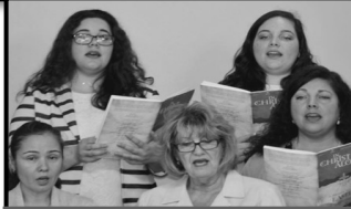
Singing Praises to God