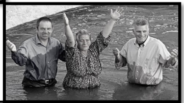
Bulgaria Woman Baptized Lifts her Hands in Praise