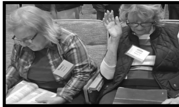
Pray in Jesus Name