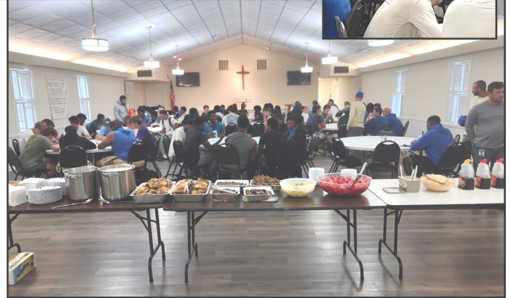
PCC Men prepared breakfast for Berkeley High School Football on Friday, Aug. 23, and fed close to 100 players, coaches and staff. The team appreciated the great breakfast and message.