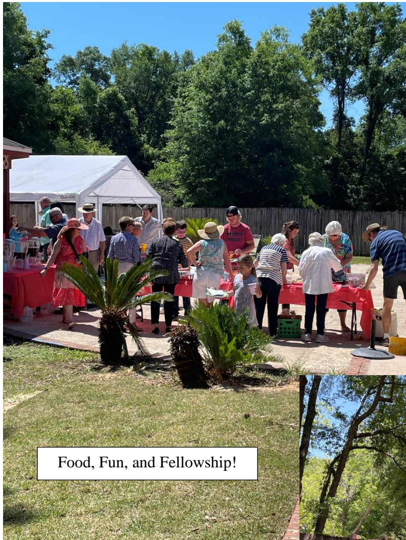
Food, Fun, and Fellowship!