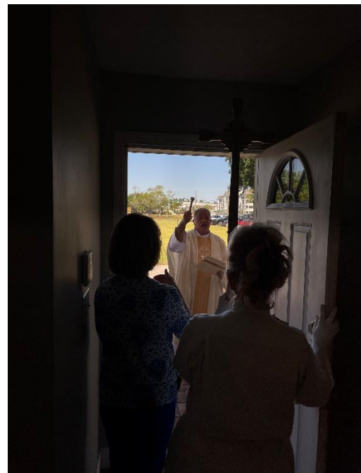
Left to right: Blessing of Back door, Meeting room, and Front door of office complex.