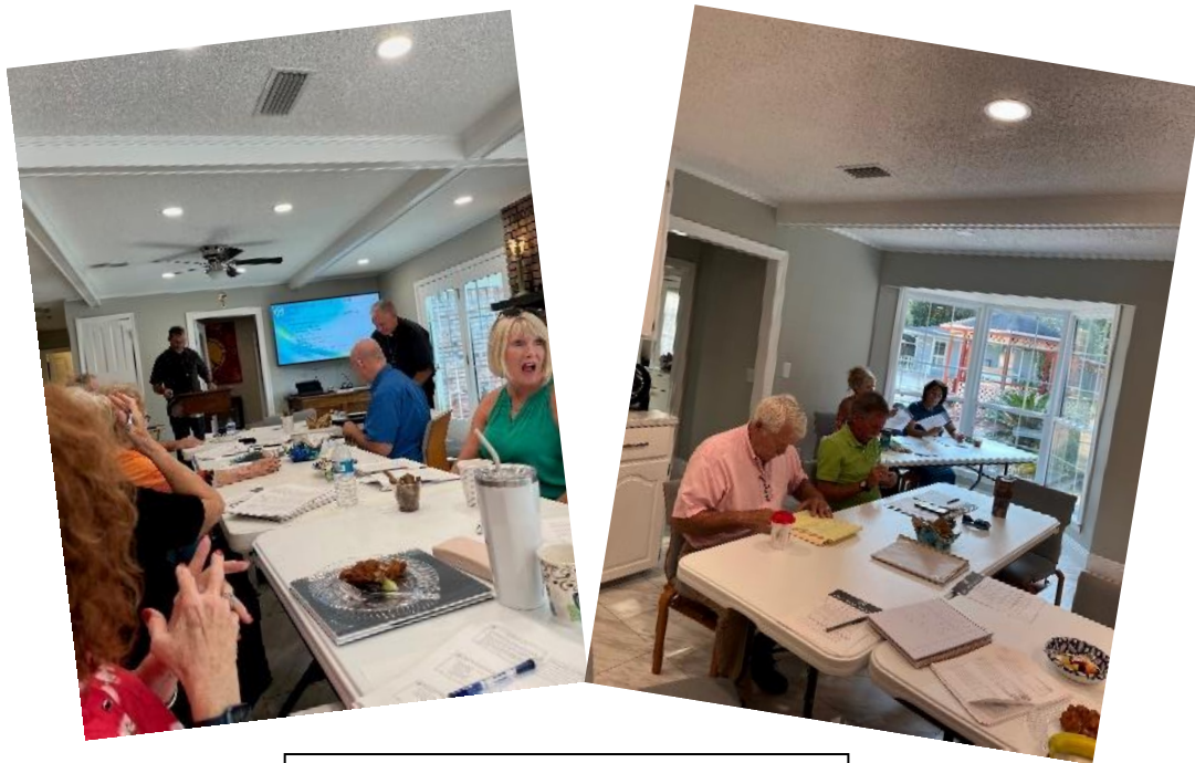
Council members working hard on plans to grow Epiphany and make it as Mission focused as possible.