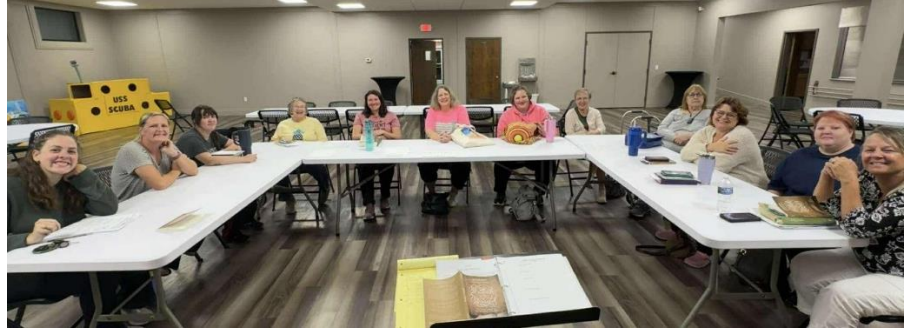
Tuesday Night Women's Study (Above)