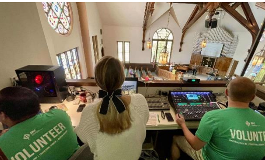
Other September Snapshots (Bottom Left)