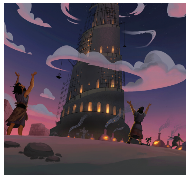
THE TOWER OF BABEL Genesis 11