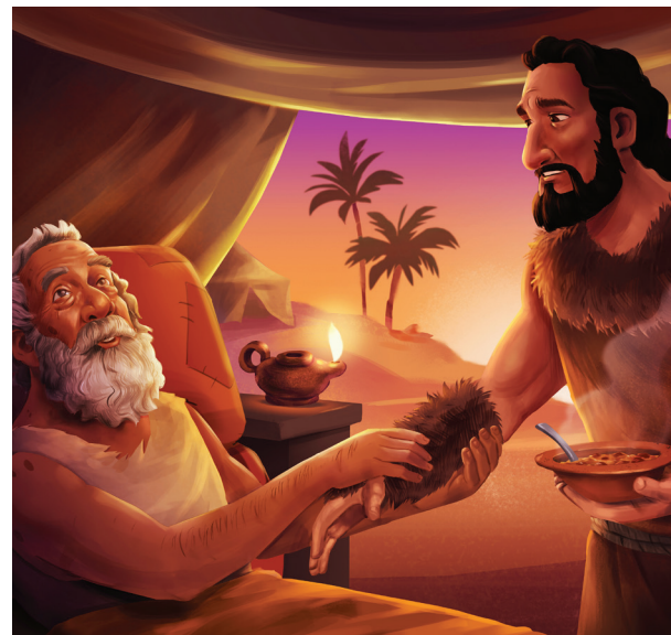
JACOB AND ESAU Genesis 25; 27