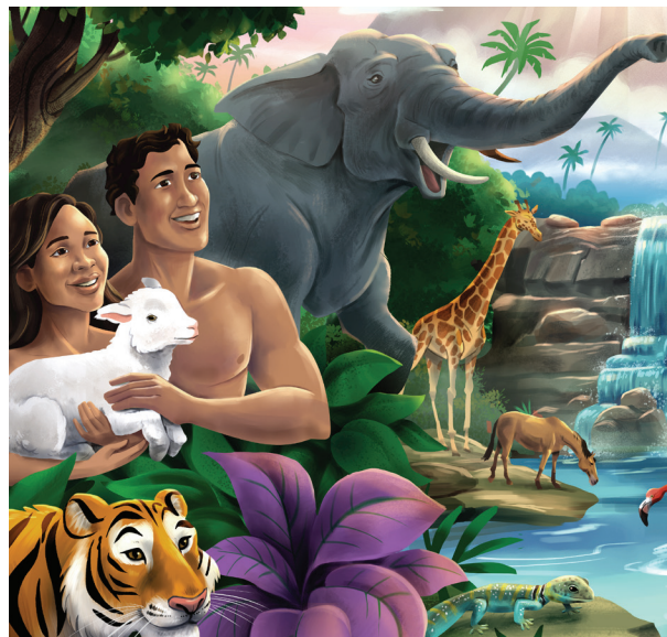
GOD CREATED THE WORLD Genesis 1-2