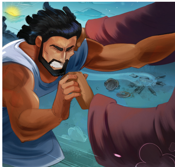
JACOB FLED FROM CANAAN Genesis 28; 32