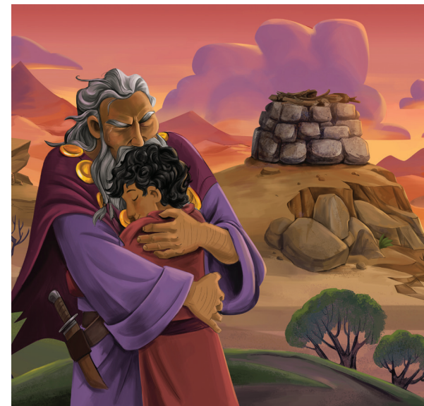
ABRAHAM AND ISAAC Genesis 22