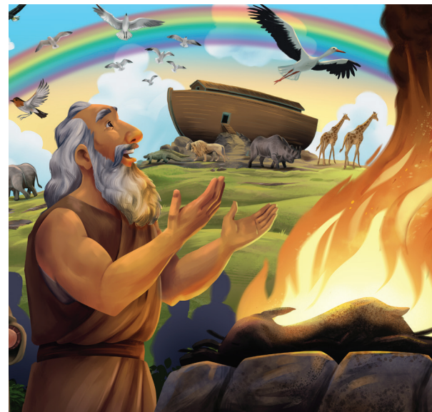
THE GREAT FLOOD Genesis 6-9