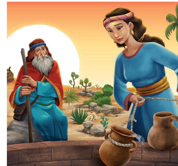
A WIFE FOR ISAAC Genesis 24–25