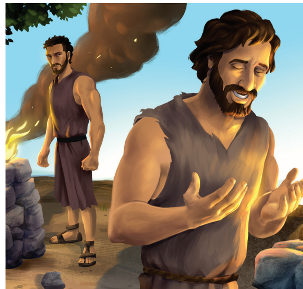
THE FIRST FAMILY Genesis 4