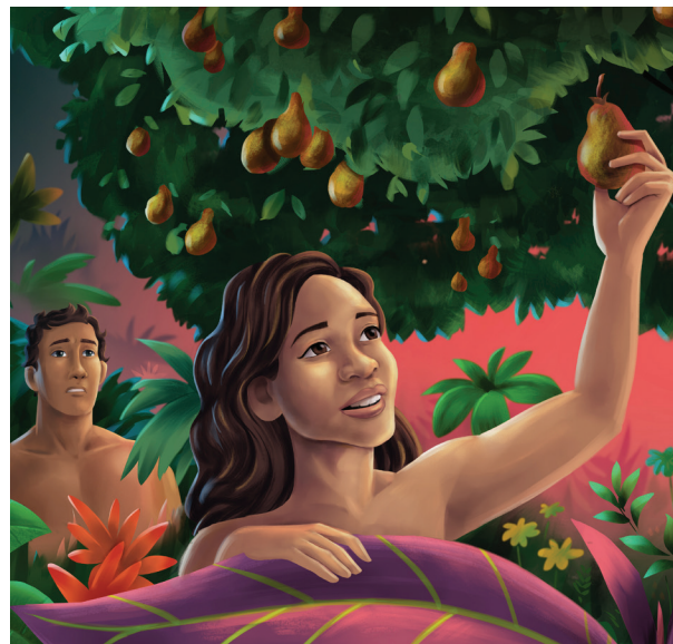
SIN ENTERED THE WORLD Genesis 2-3