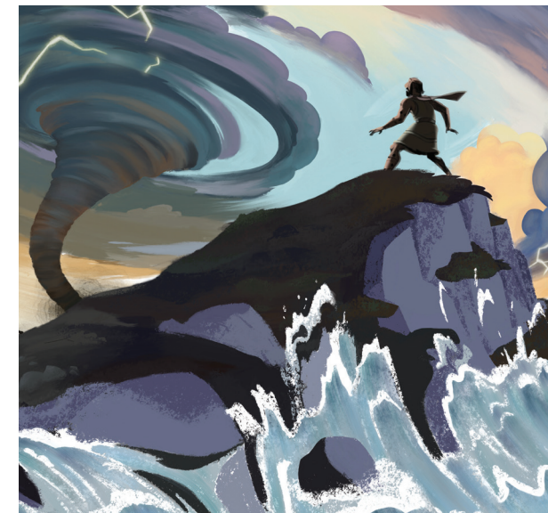
THE SUFFERING OF JOB Job