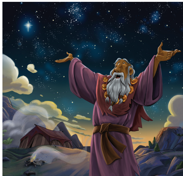
GOD'S COVENANT WITH ABRAHAM Genesis 12; 15; 17