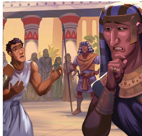
JOSEPH TAKEN TO EGYPT Genesis 37; 39-46; 50