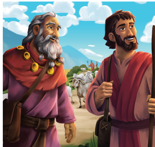
ABRAM FOLLOWED GOD Genesis 11–13