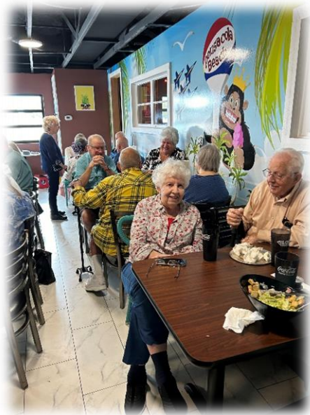
February's SOLE lunch took place at Lost Pizza Co